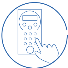
Intercom button is pressed

No wires, handsets or mechanical keys. Using GSM-based wireless technology, residents control property access from their own mobile phone.