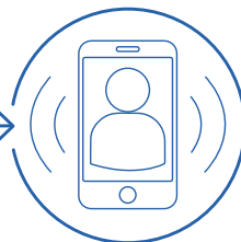
The resident sees them, and answers

This will call the pre defined telephone number.